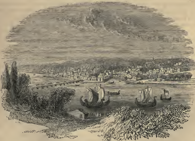
BAYONNE, as it appeared in the seventeenth century. From an old French print.